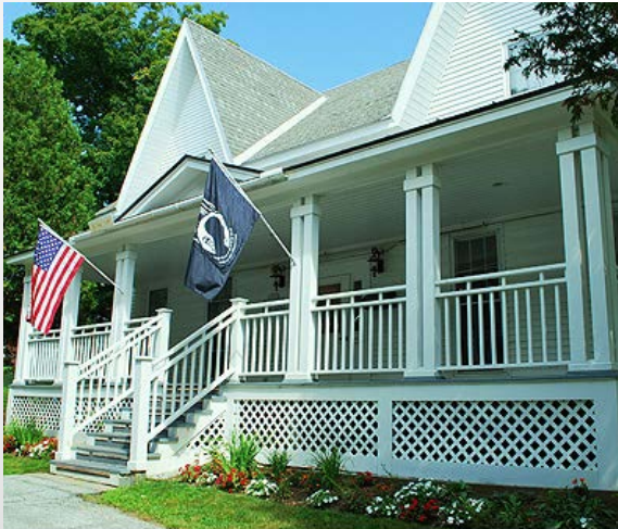
The Veterans Place, Inc. 220 Vine Street, Northfield Vermont

Guaranteeing equal access and opportunity for all.