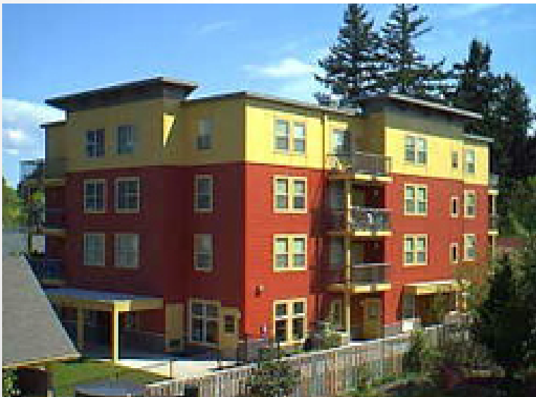
Hazelwood Station Apartments

Most reported a leverage ratio of 1:1 to 1:11