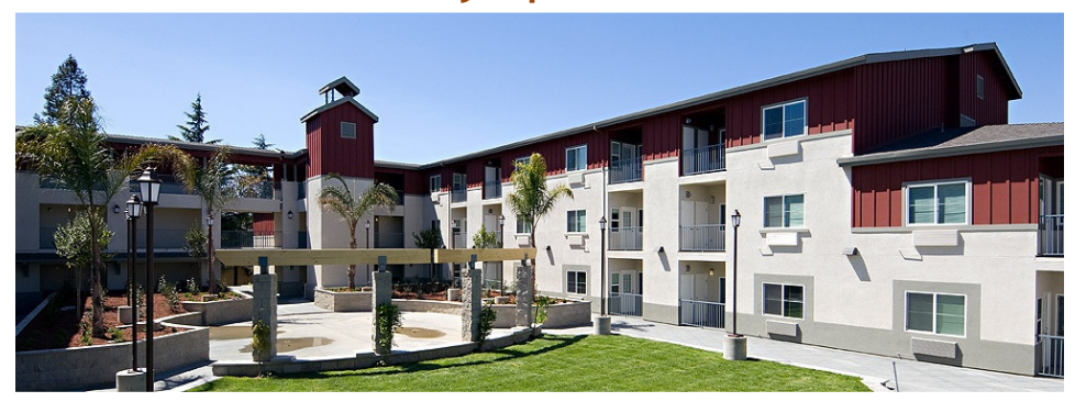
978 Almaden Lake Drive, San Jose, CA 95123

Developed by Winfield Hill Associates, a subsidiary of BRIDGE Housing Corporation, Almaden Lake Family Apartments is part of a larger mixed-income rental and homeownership community, providing affordable homes to first-time, moderate-income buyers and low- and very low-income families. Located adjacent to a regional park with nature trails and water sports and to nearby shopping, entertainment and light rail, Almaden Lake Family Apartments gives families an opportunity to stay healthy and active in the community.